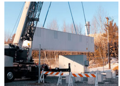
Container Lift of an Agilitas Energy ESS Project